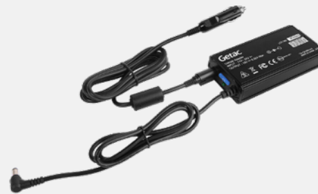
Cigarette Lighter Plug Version