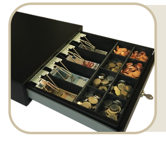
High Capacity Insert

Featuring stel construction for a prolonged operational life, the ECD405 cash drawer is able to to withstand busy retail environments.