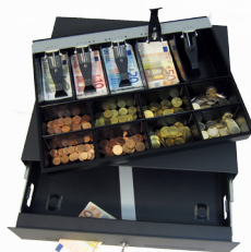
8 Coin, 5 Note Till Insert