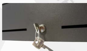
Three Function Cam-Lock